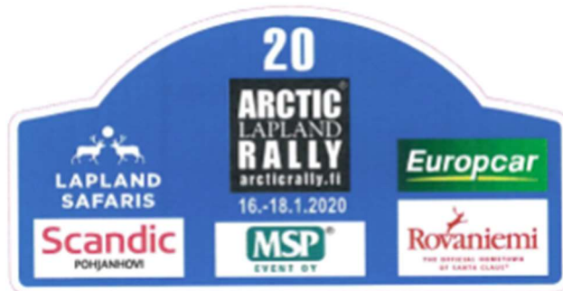
Bonnet sticker pic. 2